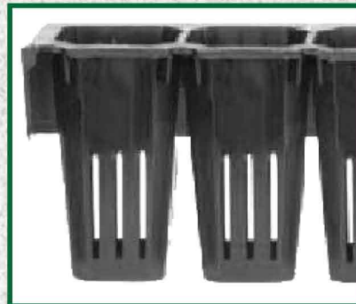
Cutaway view shows root trainers and side slits.