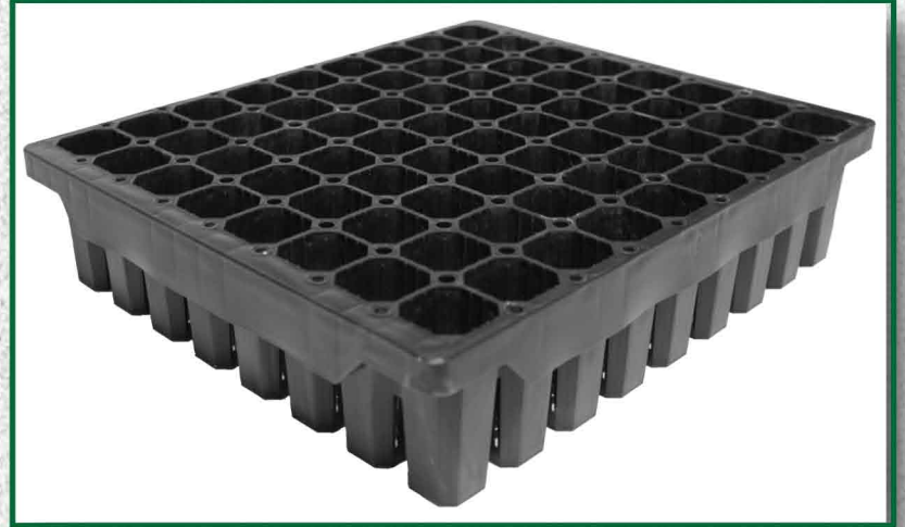
Perspective view shows venting between cells